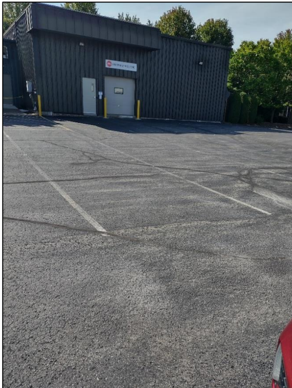
Figure 2: Subject Lands