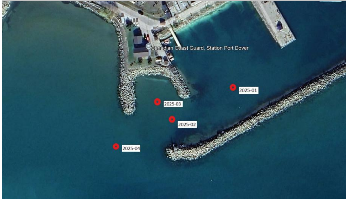
Figure 1: Locations of preliminary soil characterization samples

Analyses were completed on each sample for the following sets of compounds: