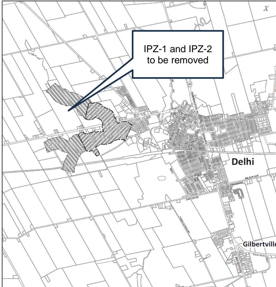
Figure 2: Zoning By-law 1-Z-2014 Schedule B-3

The referenced IPZ-1 and IPZ-2 were previously associated with drinking water threats for the Lehman Dam surface water intake for the lands described as Part of Concession 1 Lots 40 to 45, Township of Middleton, Norfolk County.